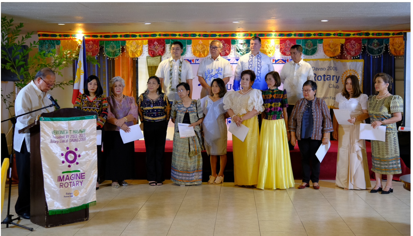
CHARGING AND INDUCTION OF HOPE-CREATING OFFICERS AND BOARD OF DIRECTORS